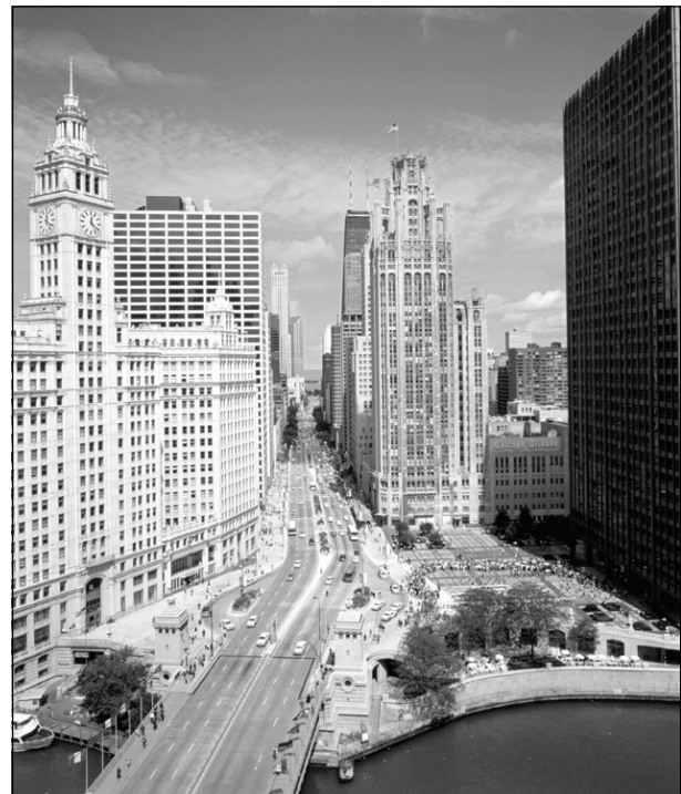
Chicago's Michigan Avenue